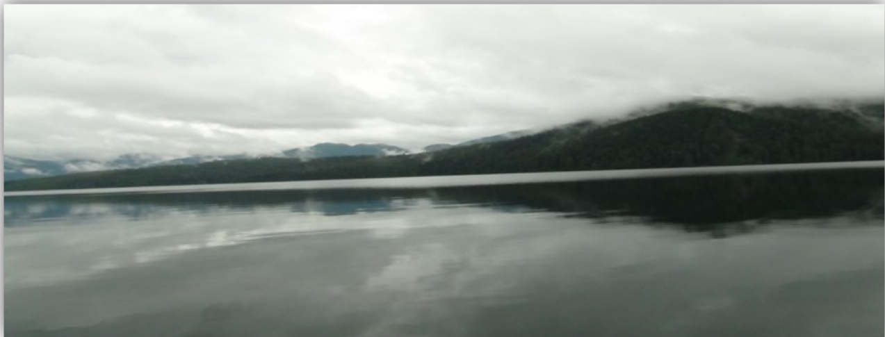
Photo submitted by : Ditidaht Heritage Researchers on the Groundtrudging trip 2014